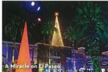
A Miracle on El Paseo