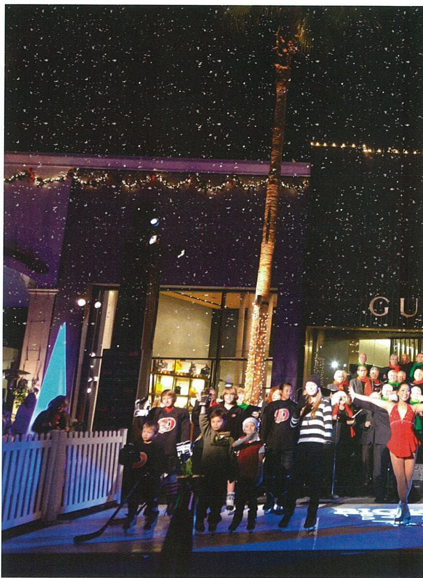
Celebrate the launch of the holiday season at "Miracle on El Paseo" and fight cancer.