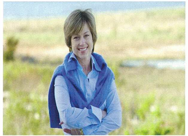
Cancer survivor & celebrity Dorothy Hamill will light the tree.

Tickets are $100; kids 12 and younger get in free