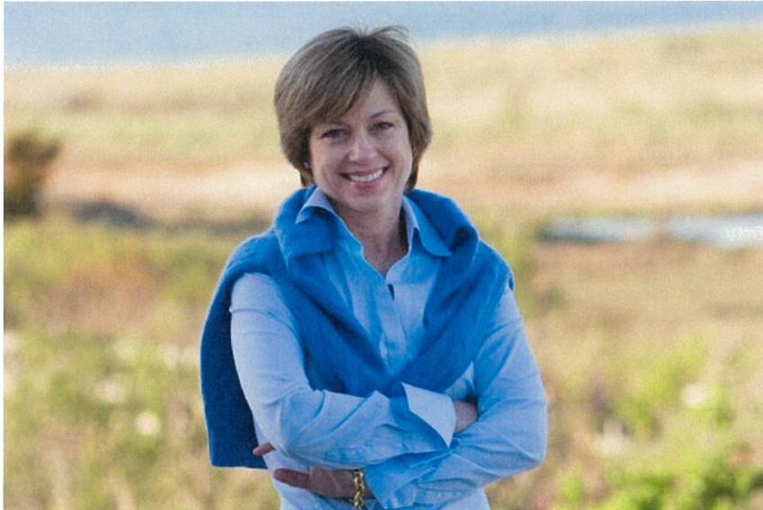
Olympic Figure Skater and longtime Palm Desert resident Dorothy Hamill DOROTHY HAMILL

With one sentence, the heat and rare humidity of a summer in Palm Desert was blanketed with images of a winter wonderland, complete with ice skating rinks.