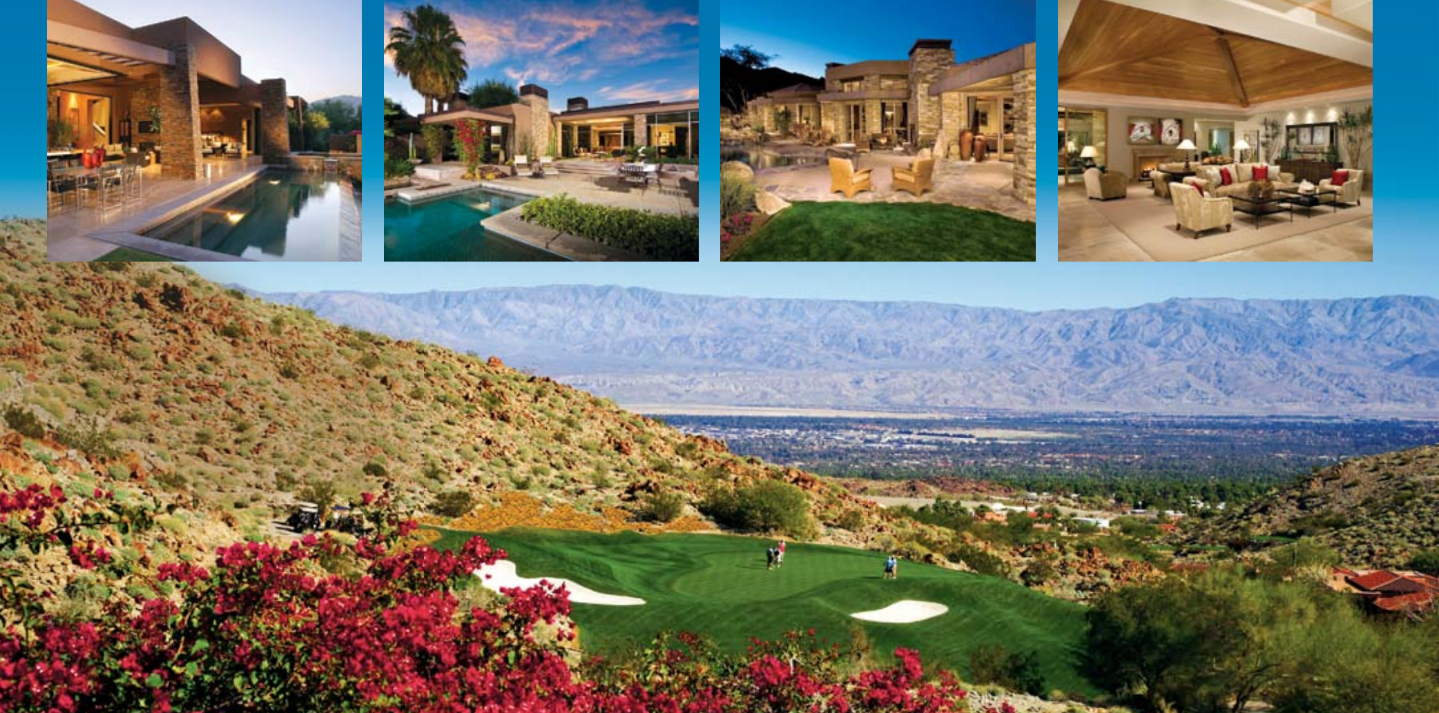
Here are a few of the 29 properties sold since January 2011. Start to experience what our new Members are already enjoying. Peek inside for the fun you're missing!